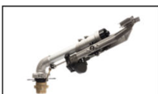
Royal (OP 75-82 mm)

With ORMApiogg EV4, irrigating is easier, more efficient and more convenient.