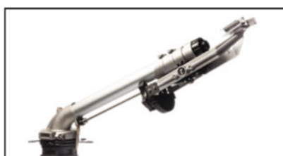
Reflex (OP 90-100-110 mm)